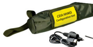
HHMD CONFIGURATION TOOL [# 63537]