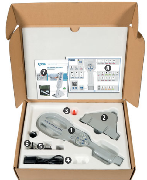
PD240CB [# PD240CB-SET]