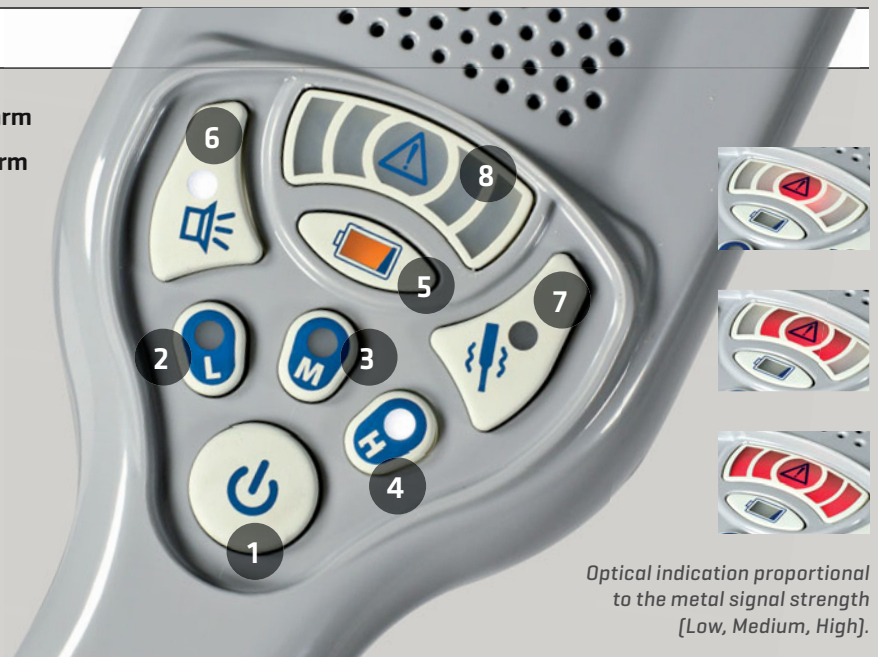
Optical indication proportional to the metal signal strength [Low, Medium, High].