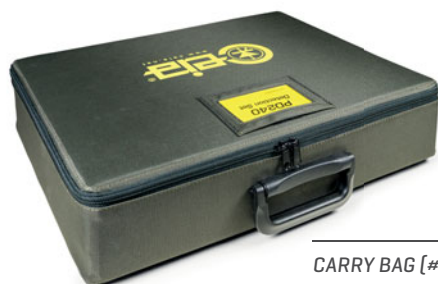
CARRY BAG [# 64082]